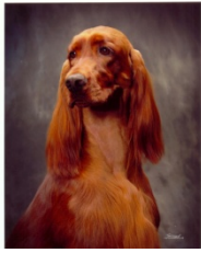
Breeze's Column of the Month