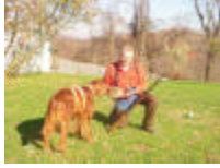
all in a day's work!