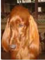
Breeze's column of the month

Mary will have all areas of "needed help" posted on the website, along with Specialty Updates and information. "Help Needed" list will include ALL EVENTS upcoming. Please look for this and help where you are available.