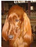
Breeze's Column of the Month